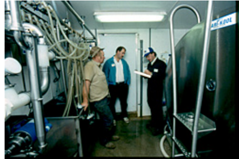
Working with your local power utility on a farm energy audit is one of the most important first steps to take in understanding how to manage energy more efficiently.