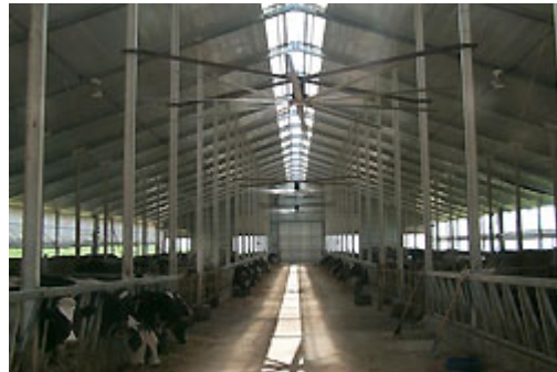
While High Volume Low Speed (HVLS) fans are normally recommended for loose housing applications, they may still be considered for modern and open free stall facilities.