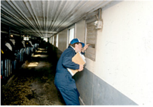
The proper sizing of barn fans and well-functioning louvers may also be included in a comprehensive farm energy audit plan.

An energy audit will help lead the way to better management, and the best place to start is to contact your power utility or the Wisconsin Focus on Energy program ( Appendix ).