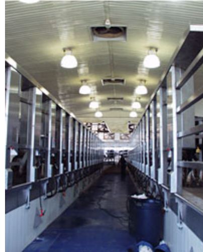
Working conditions and cow comfort, as well as conserving energy, are greatly improved when lighting fixtures are used effectively and efficiently.

A commonly used rating is the Color Rendition Index (CRI), which ranges from 0 to 100 and indicates the light's ability to render the true color of an object. Lights with higher CRI values produce light that renders a truer color, while lower CRI values produce some color distortion.