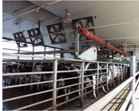
Crowd gates may not use much electricity; however, proper installation and maintenance help insure against possible transient stray voltage problems.

Again, conducting an energy audit plus assessing your present electrical system with a qualified electrician and/or your utility representative may uncover possible improvements to consider on how to maintain these devices. This will help promote efficient, safe operation and avoid future problems.